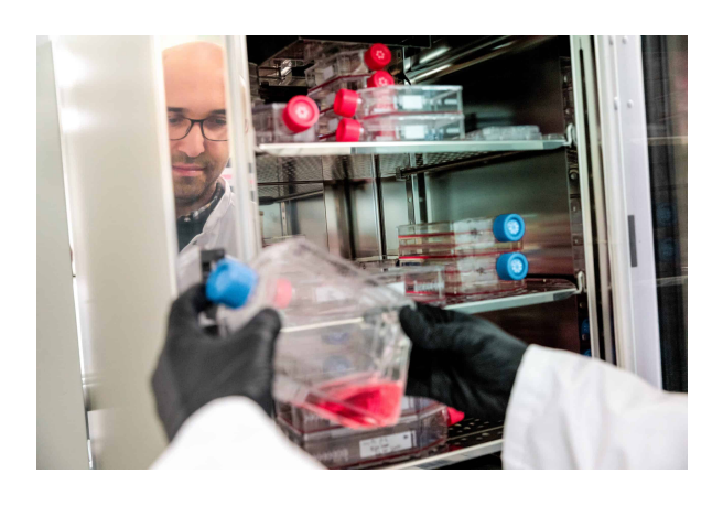
Image: A researcher examines cell culture vessels