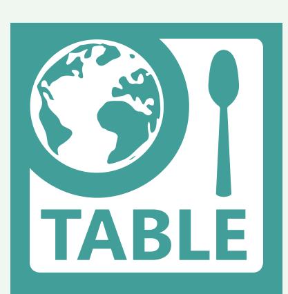
TABLE is a global platform for knowledge synthesis, for reflective, critical thinking and for inclusive dialogue on debates about the future of food

To read more from the Explainer series, visit www.tabledebates.org/explainers.