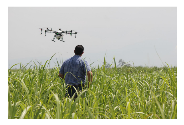
Image: Drone precision agriculture