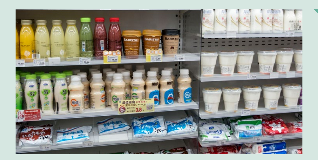
Photo: Dairy products in a convenience store, Shandong General Eccentric via Elickr