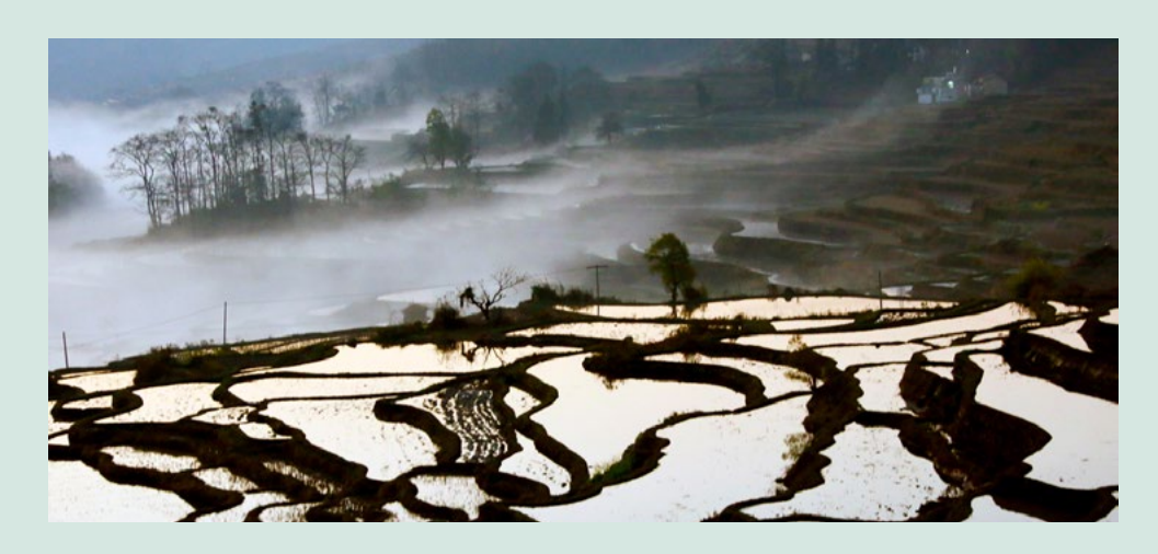
Photo: Rice terraces in Yuanyang, Yunnan Province, China